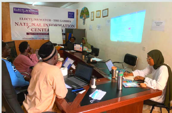
Group photo of the EWC members working on editing and finalizing the MOU, at the PAG secretariat.

This meeting discussed and finalized on the Memorandum of Understanding (MOU) to foster cooperation amongst members. Participants deliberated on the upcoming EWC Retreat and way forward from the regional debriefing sessions.