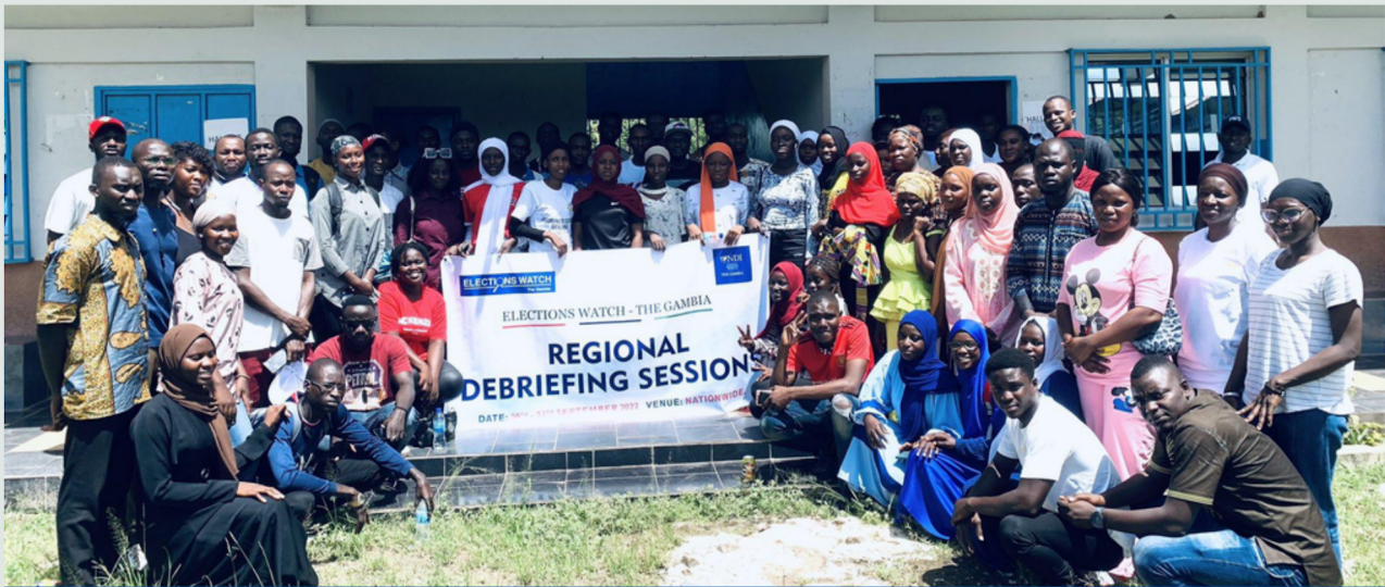
Participants of the Debriefing Sessions of West Coast Region at the Gambia College on the 27th September, 2022.

After the successful observation of the presidential and parliamentary elections respectively, the EWC leadership embarked on a nationwide debriefing with its regional election observation teams. The Debriefing conducted from the 21st to the 28th of September 2022, the tour helped the secretariat and leadership to better understand how well their internal structures functioned during the observation periods, and how they can improve in future elections.