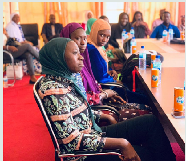
Participants concentrated on the presentations of the Debriefing Sessions at the NYC youth lab in KM