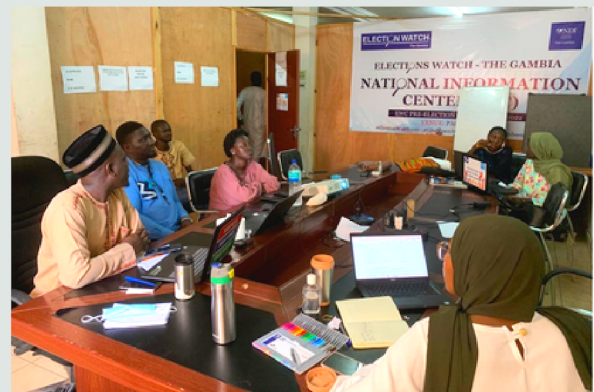
The EWC team discussing on the Retreat Preparations; discussing possible venues and the agenda

Furthermore, members discussed the preparation of the EWC strategic planning retreat which is aimed at developing 4-year strategic plan for EWC. The convergence is scheduled for 12th - 15th October 2022.