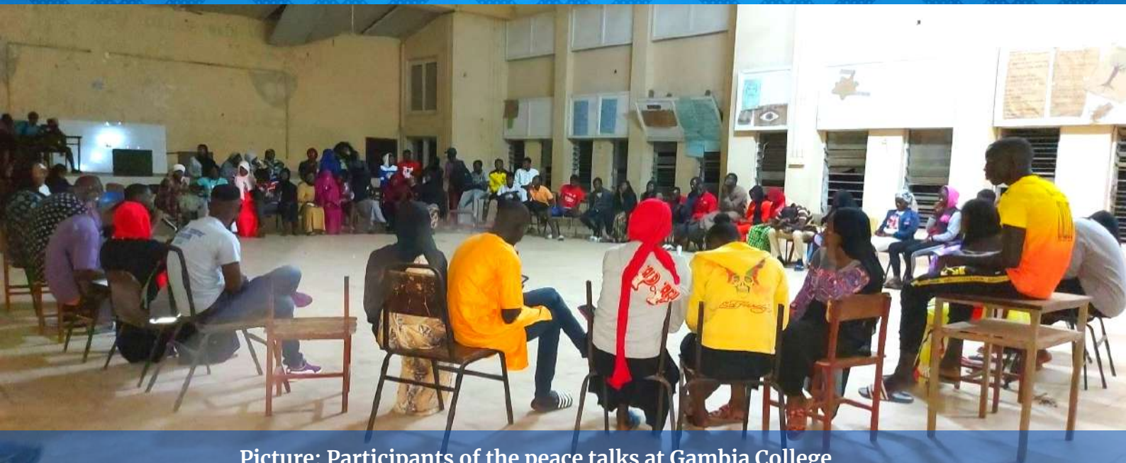
Picture: Participants of the peace talks at Gambia College

In its continuous efforts to promote peace and shun instability, Peace Ambassadors - The Gambia organized a dialogue with Gambia College students at the school's main hall in Brikama, on the 18th March, 2021.