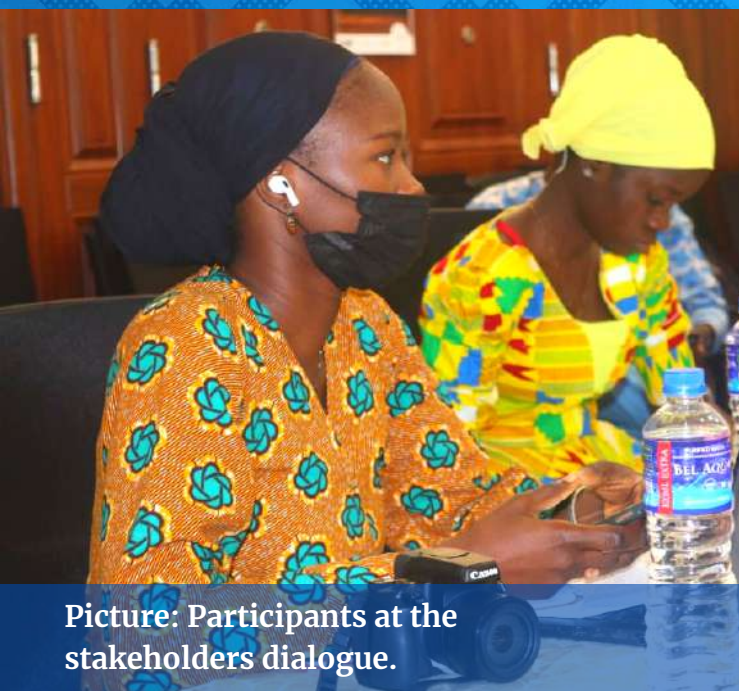
Picture: Participants at the stakeholders dialogue.

In partnership with the National Democratic Institute-The Gambia (NDI), Peace Ambassadors – The Gambia (PAG) held a stockholders' dialogue on elections at the Paradise Suites Hotel on the 24th February 2021.