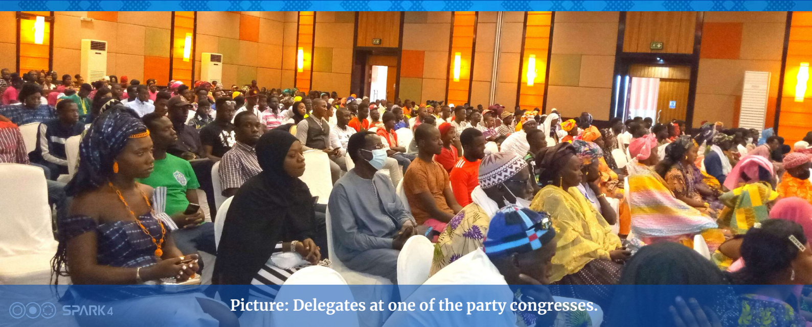
Picture: Delegates at one of the party congresses.

As The Gambia prepares for its presidential election on December 4, 2021, political parties in the country conducted their national congresses to elect leaders who will steer the affairs of their parties. These congresses were held in various locations across the country such as: People's Progressive Party (PPP) at Brikama Ba, Lower Fulladu West; Gambia Democratic Congress (GDC) at Farafenni, North Bank Region; People's Democratic Organization for Independence and Socialization (PDOIS) at Kairaba Beach Hotel and Gambia Action Party (GAP) at Coral Beach Hotel, Brufut in the West Coast Region.