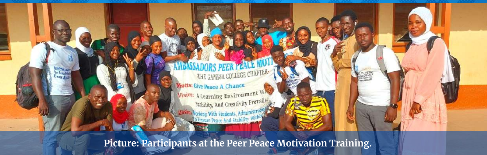
Picture: Participants at the Peer Peace Motivation Training.

In welcoming its new members onboard, Peace Ambassadors – The Gambia (PAG) held Ambassadors Peer Peace Motivation (APPM) induction training for its new intake. The day-long training, held on the 20th March 2021, brought together sixty-eight (68) participants.