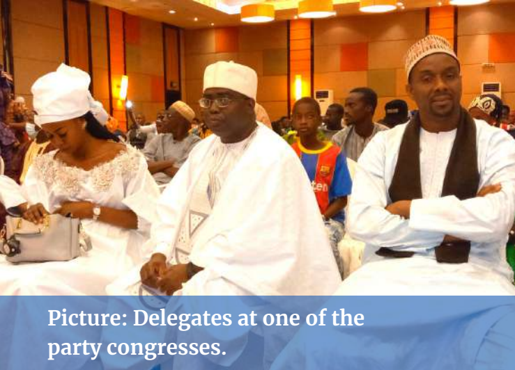
Picture: Delegates at one of the party congresses.