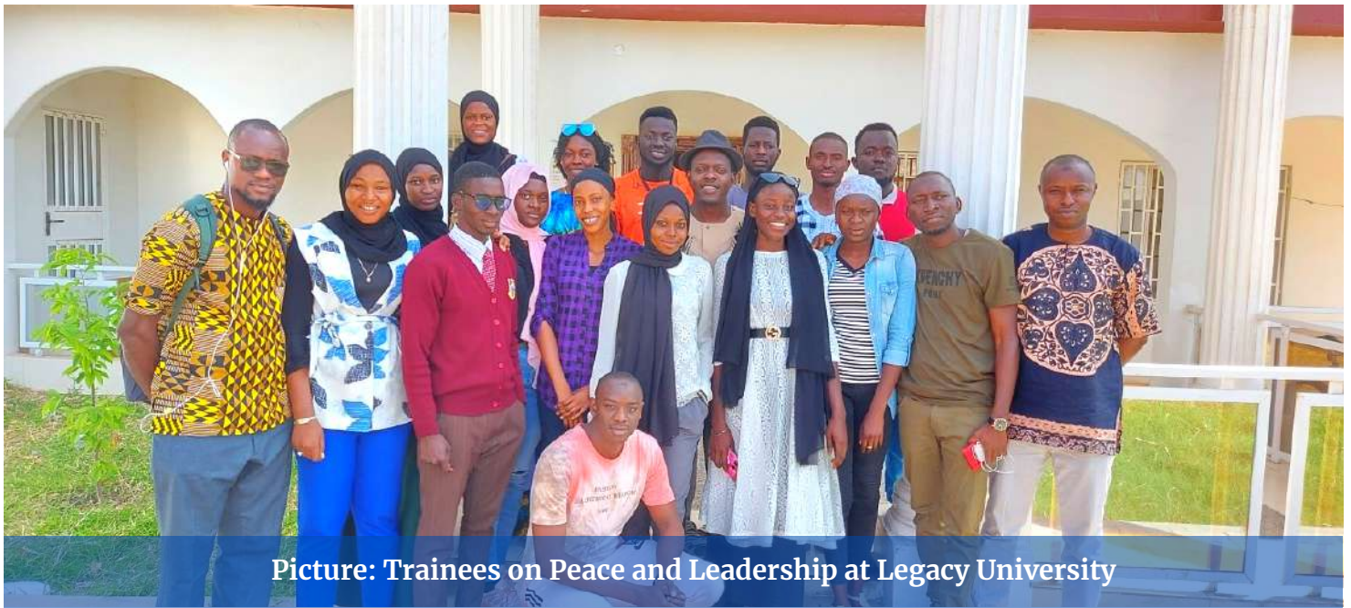
Picture: Trainees on Peace and Leadership at Legacy University